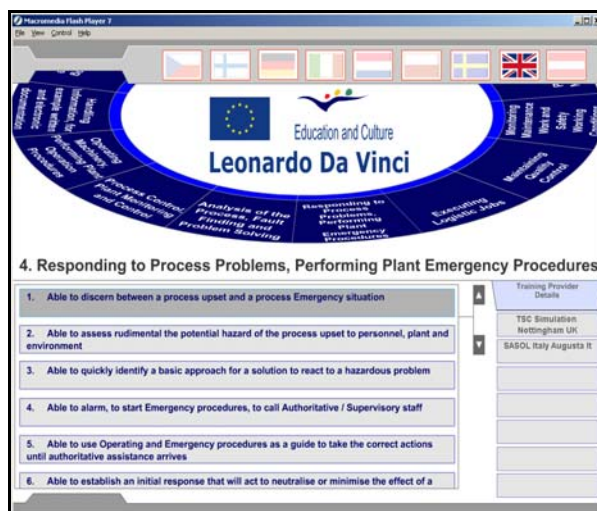
The Leonardo Wheel