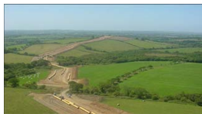
Pipelines in South Wales

With the new development of a huge LNG terminal at the Milford Haven port